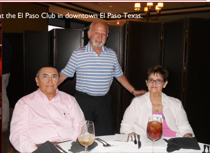
June 2016 El Paso Club downtown El Paso, Texas