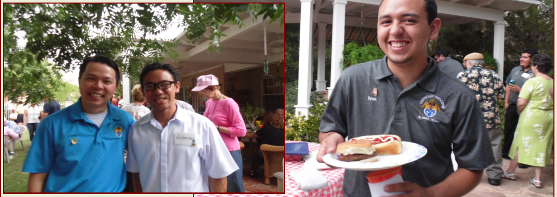
Seminarians attending our 1st Annual Summer Social